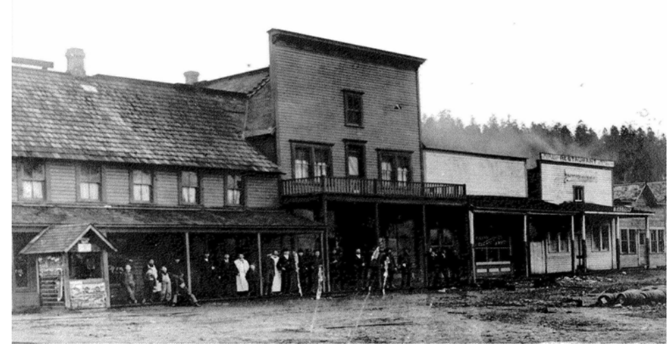
Schneider's Hotel 1903. Predecessor to Skykomish Hotel

When it comes to accounting crimes, no entity on the face of this earth employs more smoke and mirrors, more chican-