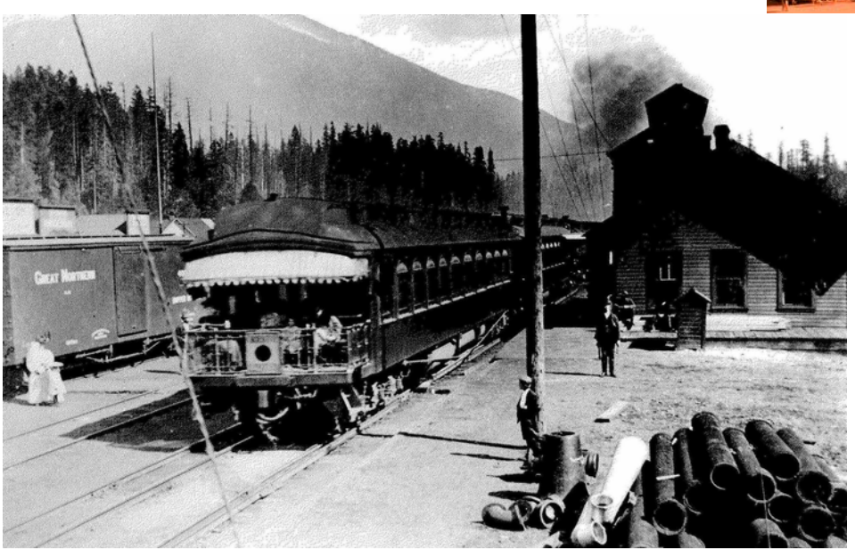
The Oriental Limited. Circa 1900

Did you know that 45% of every dollar given to the Washington State Department of Transportation (WSDOT) goes directly to administrative overhead and by the time all is said and done, only about 15 cents of every dollar actually goes to real road repairs or improvements?